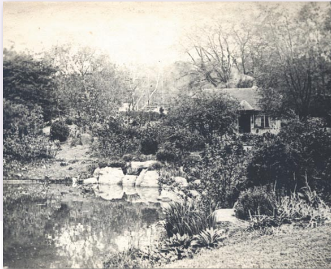
Pond Cottage c. 1896

The stable yard was placed out of the view of Coombe Wood House by building it in a small gravel pit. Just in front of the stable yard there is a small building called Pond Cottage which is older than the house and courtyard.