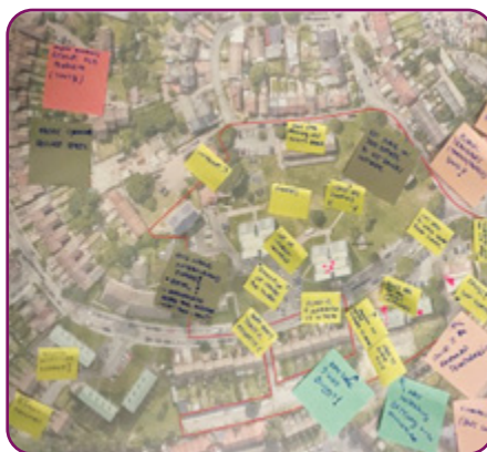
Fig. 2: Comments at design sessions made by residents

The Council has appointed BPTW Architects to work with a Resident Working Group to develop designs for the new Regina Road. Some residents will already have participated in the Design Workshops which will continue throughout the Rebuilding Project. The feedback from this initial engagement process has shaped the designs so far.