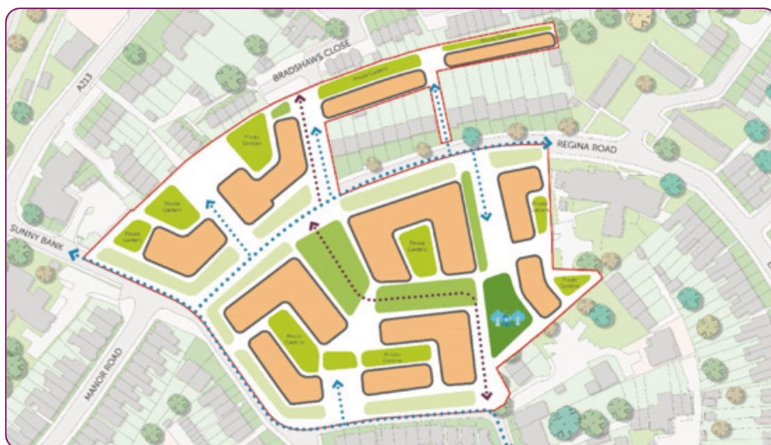
Fig 8: Indicative phasing plan