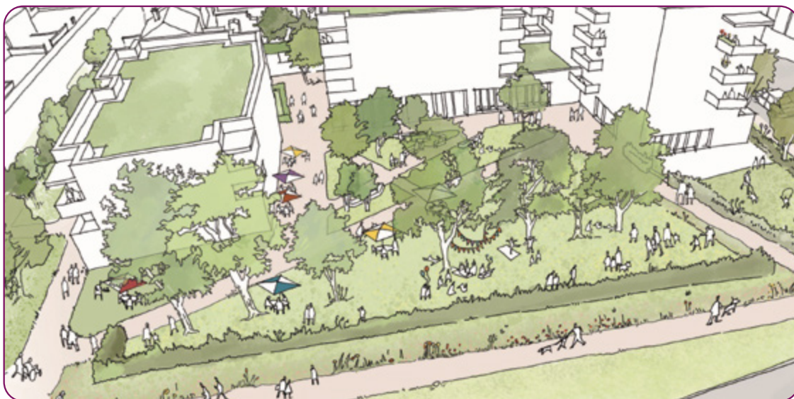
Fig 11: Indicative public realm – Green open space – example from elsewhere in London

The placement of the new buildings will be carefully considered to ensure there is no adverse impact on the adjacent neighbours, the adequate distances will be kept ensuring the privacy is maintained and there are no overlooking issues. The improvements to the pavements, lighting, landscaped edges will benefit all, existing and the new residents. The intention is that all homes on the estate will be tenure blind, this means that all new homes on the estate will be of the same quality, regardless of tenure.