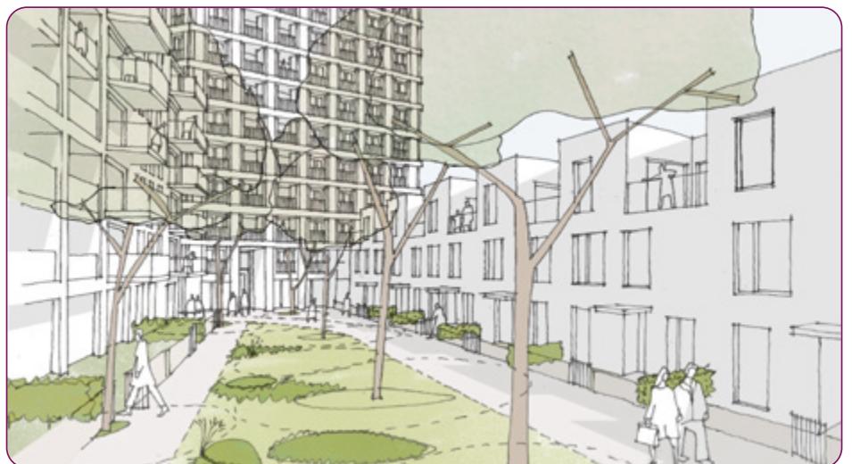
Fig 10: Indicative public realm – pedestrian boulevard - example from elsewhere in London

The public realm will be designed with inclusivity and safety in mind, in accordance with the residents’ feedback, to ensure the needs of the local community are fully facilitated. Safe, well-lit routes, open green spaces, communal courtyards, front gardens, orchard/ growing spaces, play and leisure facilities for all ages will be considered.