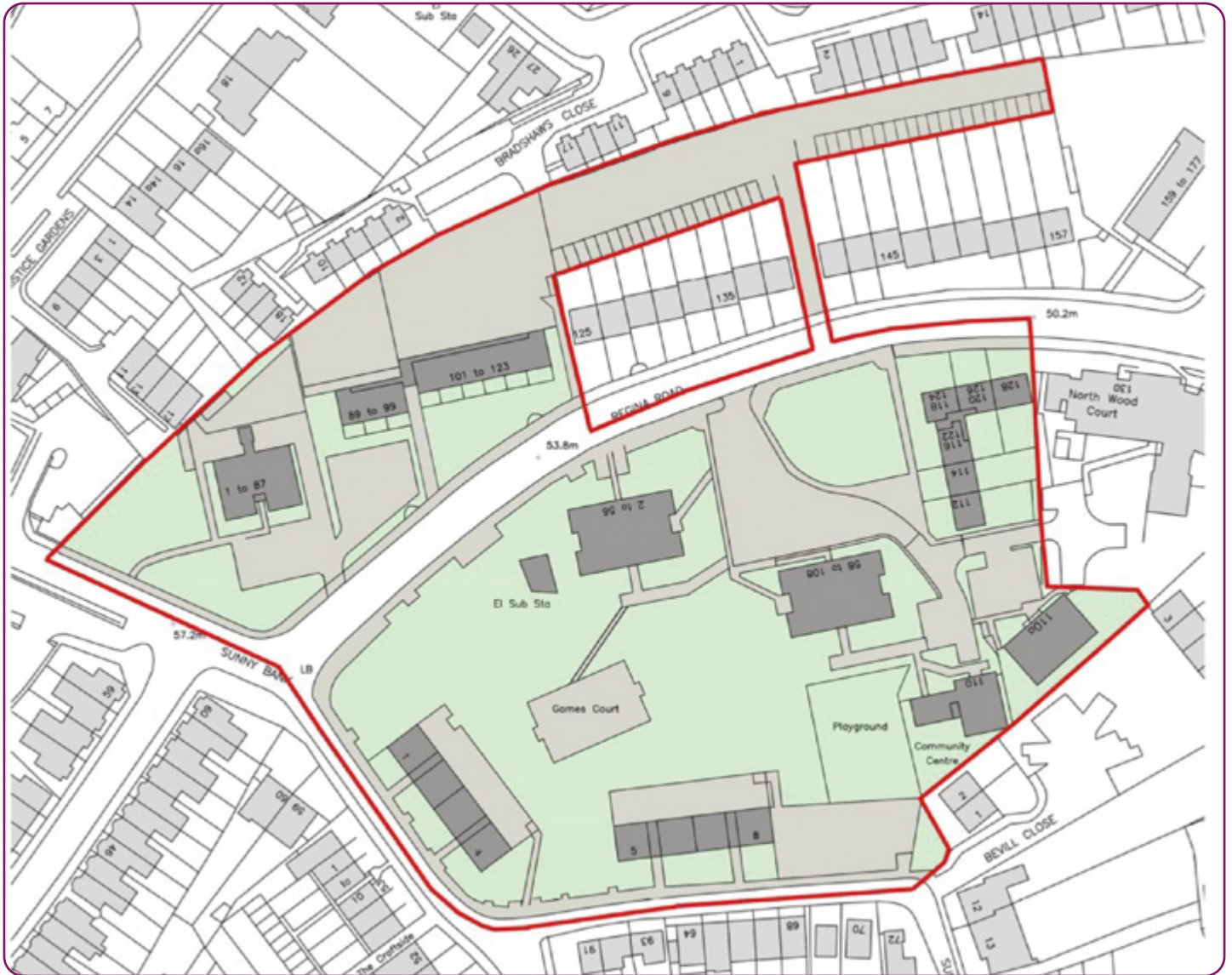
Fig. 1: Regina Road estate boundary map

This booklet contains details of the ‘Landlord Offer’, Croydon Council’s offer to you, the Regina Road Estate residents. It includes: