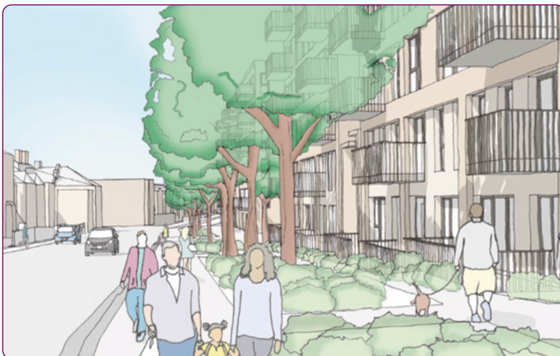
Fig 12: Indicative public realm – existing and new buildings street example – from elsewhere in London

The placement of the new buildings will be carefully considered to ensure there is no adverse impact on the adjacent neighbours, the adequate distances will be kept ensuring the privacy is maintained and there are no overlooking issues. The improvements to the pavements, lighting, landscaped edges will benefit all, existing and the new residents. The intention is that all homes on the estate will be tenure blind, this means that all new homes on the estate will be of the same quality, regardless of tenure.