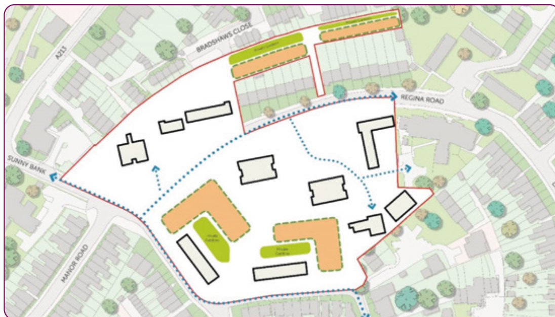
Fig 7: Indicative phasing plan

Phase 1 is proposed to include a nearby site for an estimated 9 new homes, plus around 120 new homes at Regina Road. This should be sufficient to rehouse all existing households who are living in Council tenanted property at Regina Road. The Council is also purchasing some newly built homes nearby for early moves.