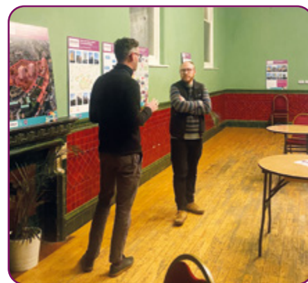
Fig. 3: Design sessions at Stanley Halls

The Architects will continue to work with the Resident Working Group to draft a Masterplan for the area and to prepare a Planning Application for a Phase One project which will be developed ahead of any demolition so the Council can start building as soon as possible.