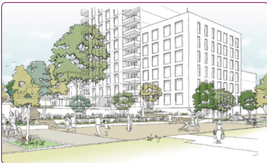
Fig. 4: An example of a BPTW designed - regeneration [image credit BPTW]

The Architects will continue to work with the Resident Working Group to draft a Masterplan for the area and to prepare a Planning Application for a Phase One project which will be developed ahead of any demolition so the Council can start building as soon as possible.