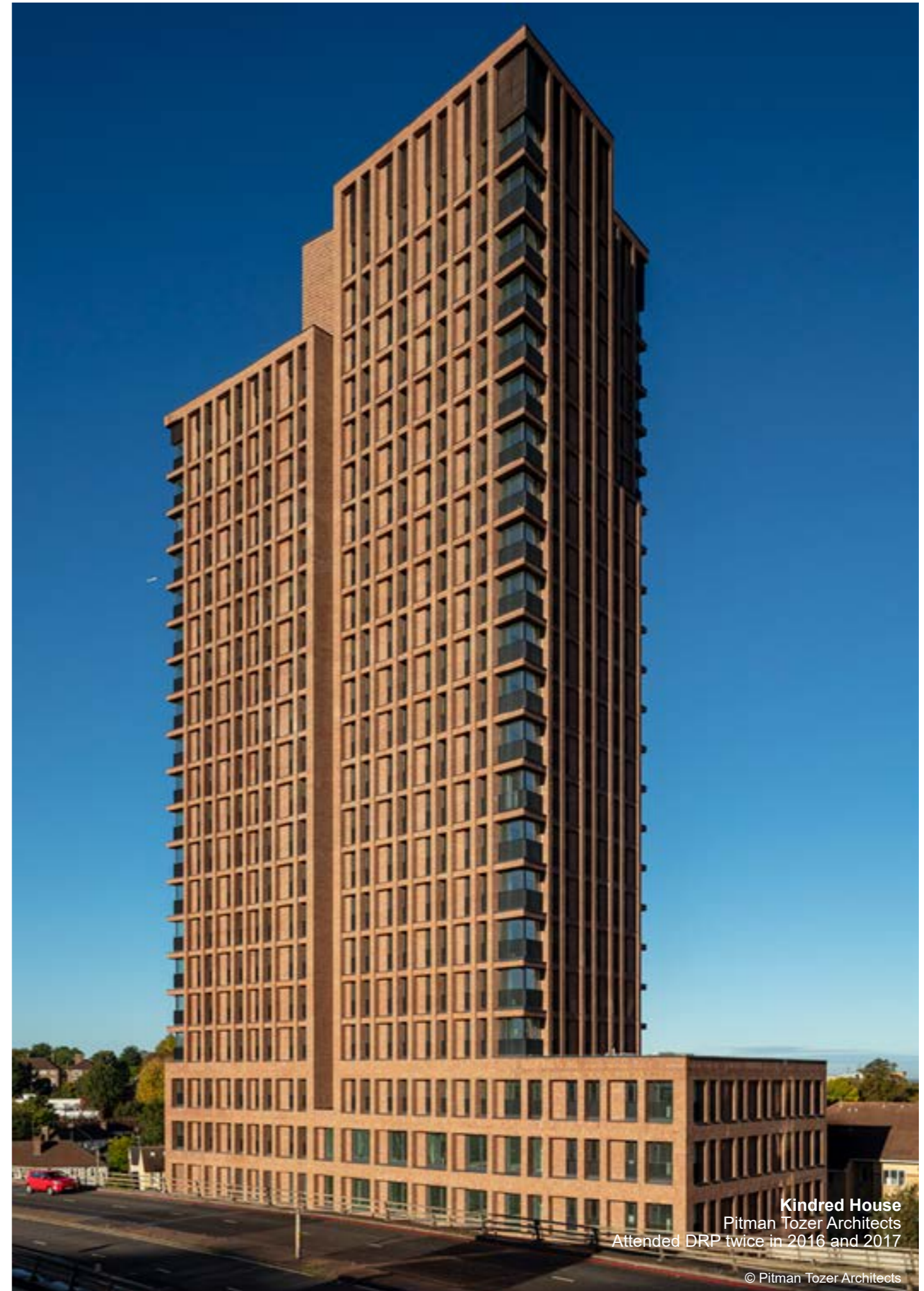
Kindred House Pitman Tozer Architects Attended DRP twice in 2016 and 2017

4.6.3. Cancellations and postponements will only be accepted in exceptional circumstances and no later than 2 weeks before the scheduled meeting date. Any cancellation or postponement made less than two weeks before the scheduled meeting date will incur a cost of 50% of the fee.