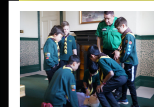
Life saving challenge