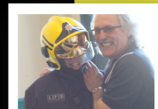
Fire suit challenge

For more details on fire safety in the home: www.london-fire.gov.uk/safety/the-home/