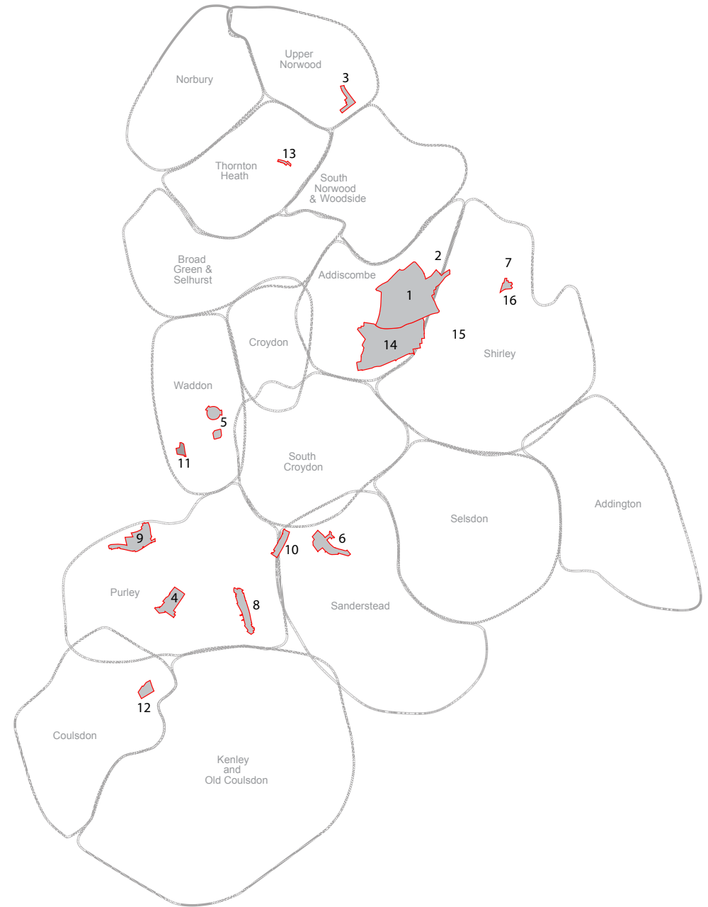
Map 2. Locations of additional areas considered for Local Heritage Area (LHA) designation