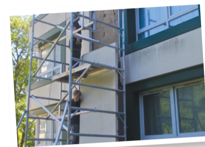
Checks on high-rise blocks see page 2

Large print: to receive Open House and other housing information in large print, please call 020 8726 6100