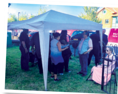
Keeping you informed see page 3