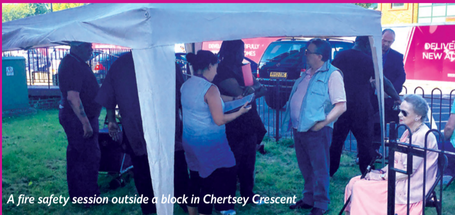
A fire safety session outside a block in Chertsey Crescent

At the time of printing this newsletter, almost all of the visits had been done. If you have not yet had your session, you will receive a flyer two days in advance. If you missed any of the visits, below are some of the subjects that have been discussed with tenants and leaseholders, from fire safety tips to insurance advice.