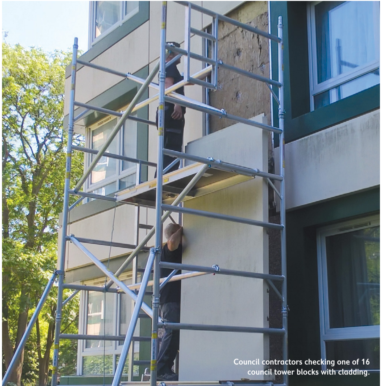
Council contractors checking one of 16 council tower blocks with cladding.

The council's housing team has written and hand-delivered letters to all residents in council blocks of six storeys or higher, as well as going door-to-door and holding a separate series of visits to each block earmarked for fire sprinklers. The council has also written to residents in lower-rise buildings between three and five storeys.