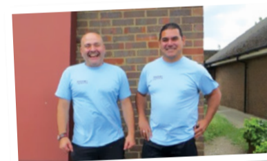
Fire safety tips see page 4