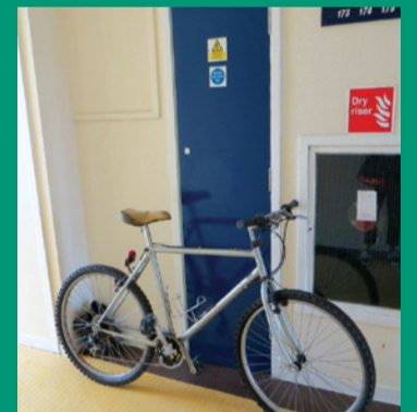
A bicycle left blocking access to fire safety equipment